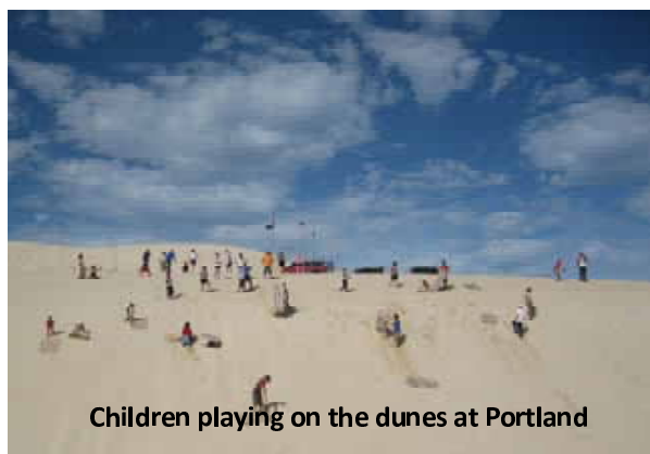
Children playing on the dunes at Portland

Our Club is very active in Driver Education at a practical level. As a member you would be welcomed, and encouraged, to participate in the courses offered.